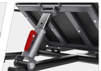
5-Position Adjustable Footplate