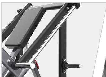
High-Precision Linear Guide System