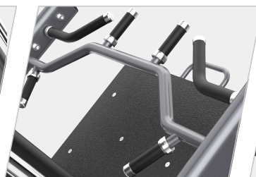
Multi-Grip Handle Options